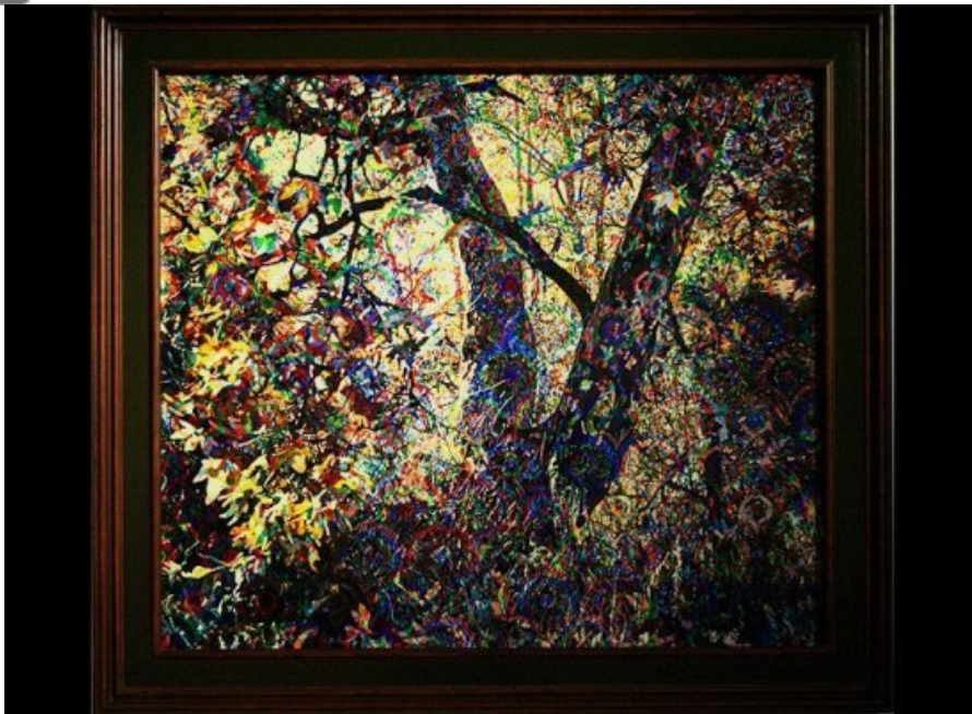
Stone Maple, 1971 -1972, oil on panel, copyright the artist, Another Year in LA, Pacific Design Center, West Hollywood through November 10.