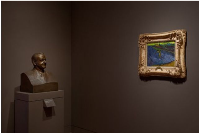
Nikolai V. Tomsky, Portrait Bust of Dr. Hammer, 1982-83, bronze, the Armand Hammer Collection

If art schools would be smart and practical enough to give reasonable attention to the art of portraiture, then some talented students might choose it as their career path. As a result, a healthy portion of the market would be taken away from bad and mediocre craftsmen.