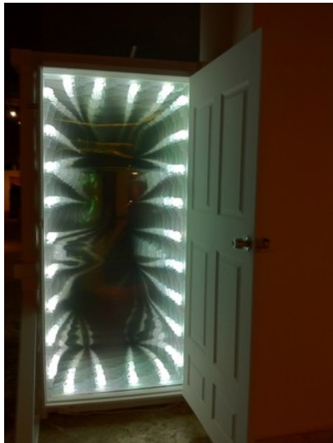
MFA graduates at the Pacific Design Center

However, the majority of the artwork came across as, if I may say so, seriously under cooked. God help these young artists as they enter into the real world, and try to support themselves. There was not a trace of figurative painting or sculpture among the artworks, which is not a surprise considering that such work is thought of as completely outdated, totally out of fashion, and mostly ignored by art schools.