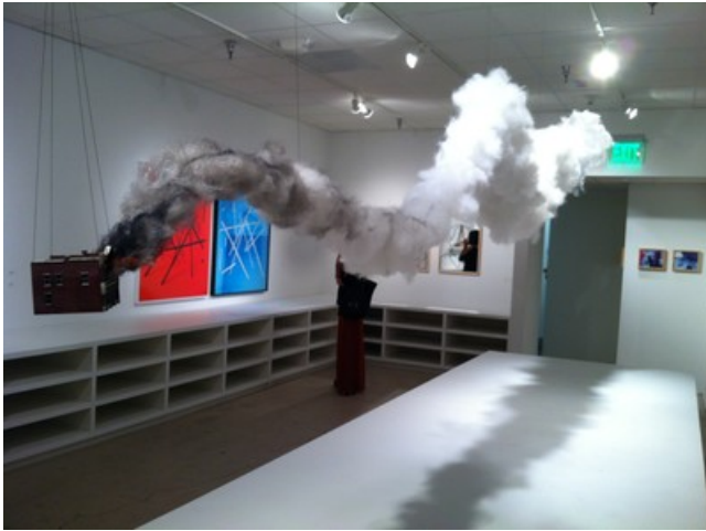
MFA graduates at the Pacific Design Center

lights shining at me, trying to decide what would happen if I dared to enter. Do I see the light at the end of the tunnel ...or... is it the light of an approaching train?