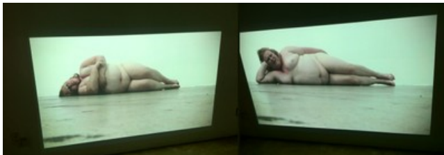
MFA graduates at the Pacific Design Center

Considering that Southern California is known for having the country's highest concentration of very good art schools, one wonders why the school names are not proudly displayed. As a sort of revenge, I am omitting the names of the artists while showing their works on our website.