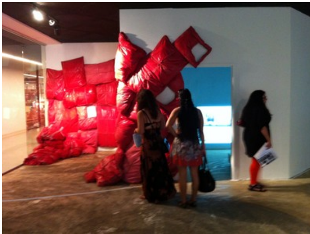
MFA graduates at the Pacific Design Center

Last Friday night, the Blue Building at the Pacific Design Center hosted the opening of the exhibition of the artworks by graduates of several Southern California art schools. The exhibition occupies the several showrooms on the second floor and it is open to the public through August 24th. The committee chose 90 MFA graduates and the resulting exhibition, as one might expect, is rather a mixed bag.